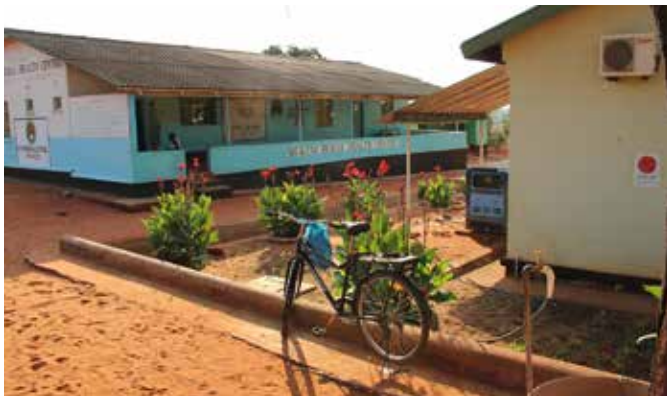
Mukini Health Center.

to return before coming to the health center. Lay counselors recounted many stories of women who wanted to deliver in a health facility but ended up delivering at home while waiting for permission from an absent partner, a dilemma that has diminished in frequency through the project's actions to increase male involvement.