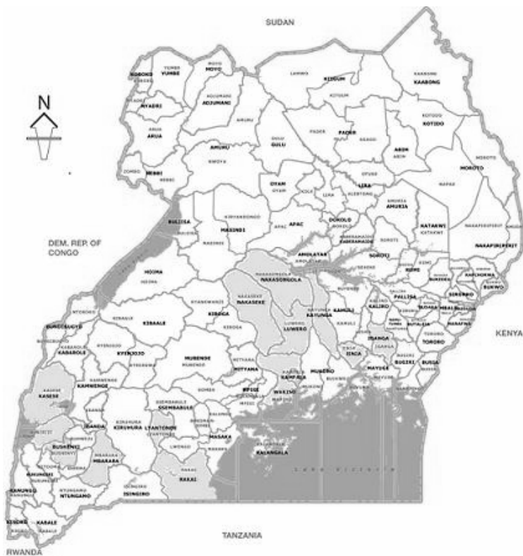
Figure 1: map of Uganda showing districts reporting at least one KMC facility