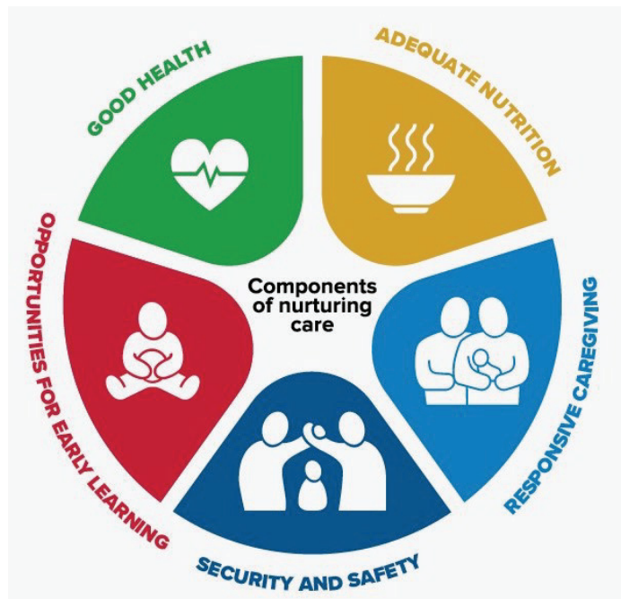
Figure 1: A Framework for Nurturing Care

Quality, Equity, Dignity: A Network for Improving Quality of Care for Maternal, Newborn, and Child Health also offers a conceptual framework that upholds the importance of family engagement during healthcare delivery. 31 (Figure 2) This framework supports the idea that equitable and people-centered health services are essential parts of quality care. It acknowledges that families and communities need to be engaged in the process to build trust, access, and demand for quality maternal, newborn, and child