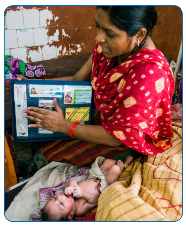
Mothers and their newborn children in the post natal ward at the district hospital in Arrah, Bihar.

Offering modern contraception services as part of care provided during childbirth increases postpartum contraceptive use and is likely to reduce both unintended pregnancies and pregnancies that are too closely spaced.<sup>1,2</sup> Unintended and closely spaced births are a public health concern as they are associated with increased maternal, newborn, and child morbidity and mortality.<sup>3-5</sup> After a live birth, the recommended interval before attempting the next pregnancy is at least 24 months, based on a consultation convened by the World Health Organization (WHO), in order to reduce the risk of adverse maternal, perinatal, and infant outcomes.6 Despite this evidence, 61% of