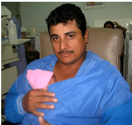
A father holds his newborn in the Kangaroo position in Nicaragua.

Each participating hospital has a dedicated KMC unit, where families can provide Kangaroo Care to their newborn and receive support from the hospital staff. Participants are taught KMC concepts and while in the program, attend daily meetings held in the program unit. These educational workshops cover such topics as breastfeeding and baby care, among others.