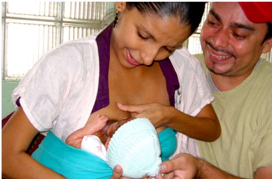
Parents practice the Kangaroo method together in El Salvador.

A s a component of its work to address neonatal mortality, the USAID Health Care Improvement Project (HCI) is working with five Latin American countries to implement national Kangaroo Mother Care programs: