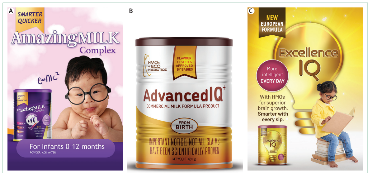
Figure 4: Artwork illustrative of actual packaging that make or imply claims about intelligence and intelligence quotient. Any resemblance to actual product packaging is coincidental

convinced through identification, understanding, and empathy. Parents' experiences of CMF marketing vary by country, including how the claims of CMF are presented and understood (panel 2).