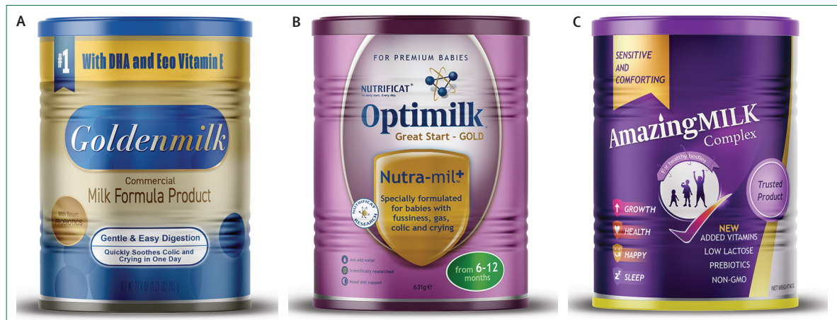
Figure 3: Artwork illustrative of actual packaging that claim to alleviate infant discomfort. Any resemblance to actual product packaging is coincidental