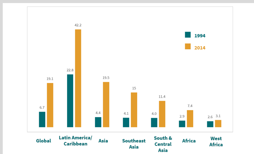
Figure 3: Global trends in C-section rates