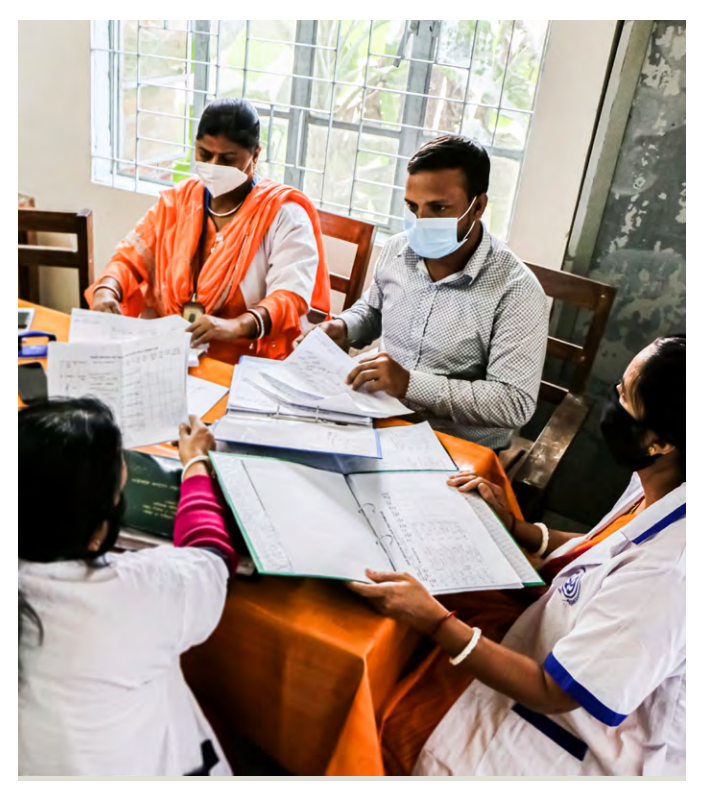
Medical officers (MOs), upazila family planning officers (UFPOs), assistant UFPOs, FPIs, FWAs, FWAs, FWAs, sub-assistant community medical officers (SACMOs), HAs, AHIs, and women union parishad members attend Fortnightly Meetings like this one in Jalalabad, Sylhet.

9,087 participants from DGFP and DGHS collaborated to identify opportunities to strengthen community-based PPFP, ANC, facility delivery, and more