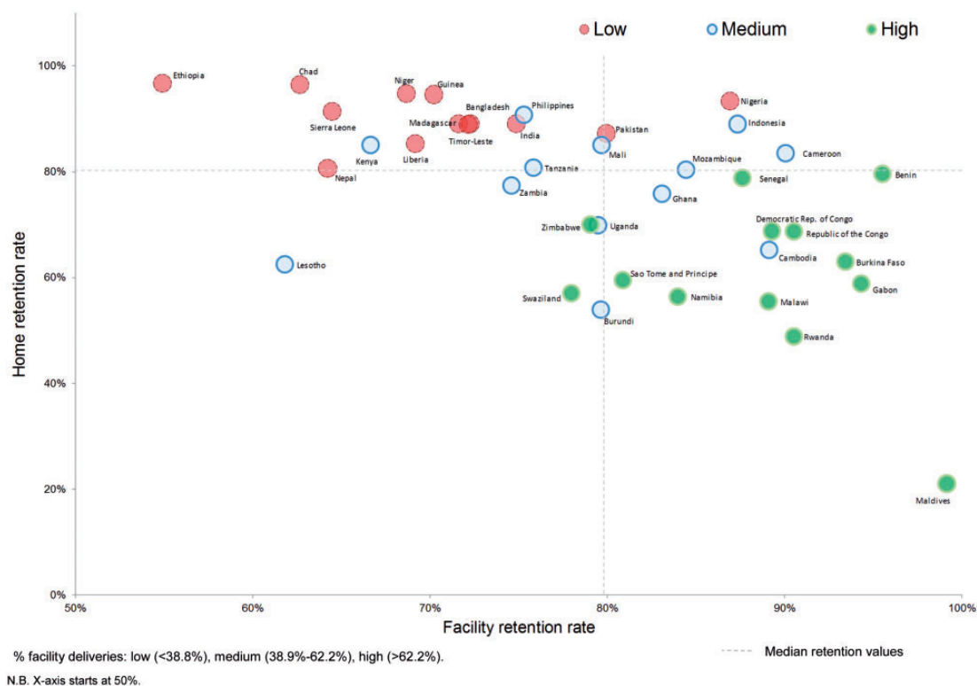
Figure 2. Ecological scatter graph of countries by home and facility retention rates between first and second deliveries, colour coded by percentages of all births in facilities