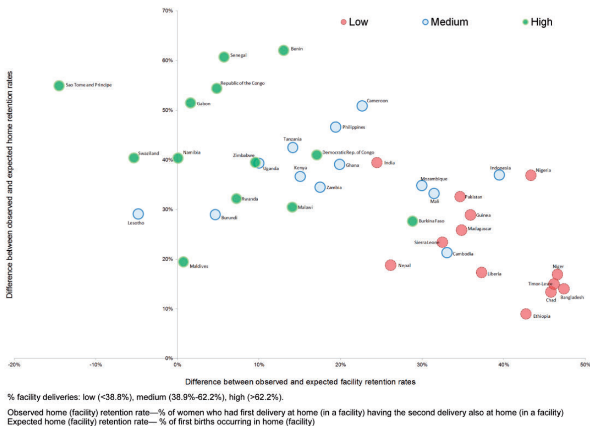
Figure 3. Ecological scatter graph of countries by the difference between the observed and expected home and facility retention rates between first and second deliveries, colour coded by percentages of all births in facilities